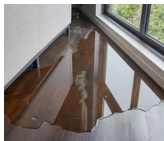
Water damage restoration