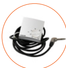
Hygrostat with 3m cable, jack plug and fitting 1 110 552