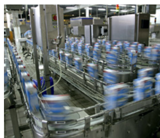
General industry & production