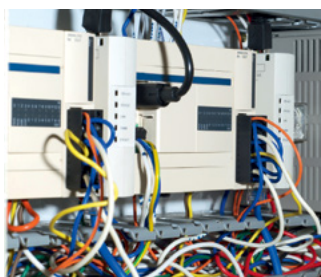
Data centres & telecoms