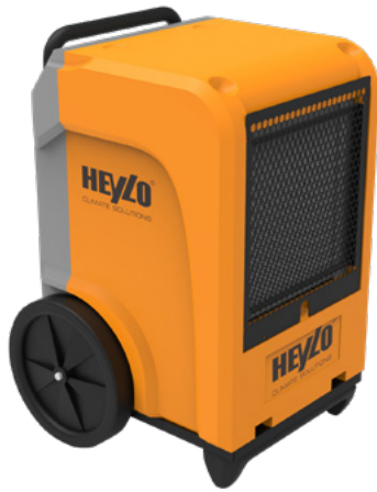
HEYLO KT 45