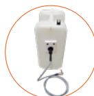
Water tank 1 110 561