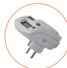
Plug-in Hygrostat (10-90% RH/ 10-60°C) 1430047