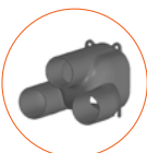
Hose adaptor 3 x 50mm 1 306 553