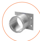
Hose adaptor 1 x 100mm 1 306 539